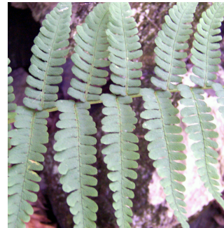
Twice Cut (pinnae "cut" into pinnules)