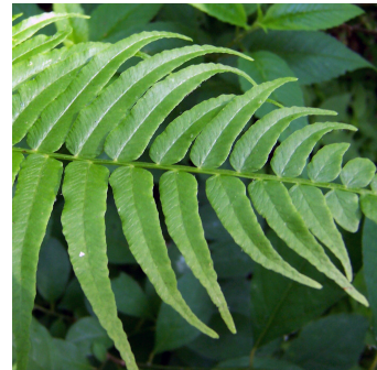
Once Cut (no pinnules)