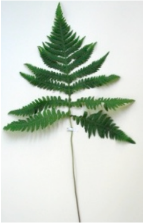
Broadest at the base