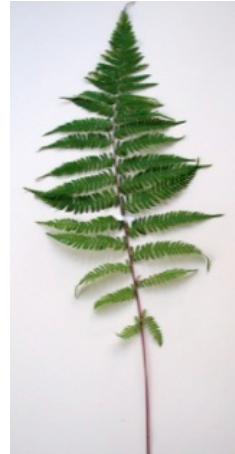
Semi-tapering to the base