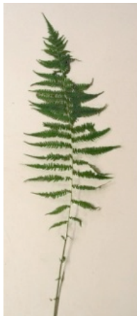
Tapering to the base