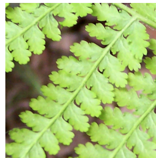
Thrice Cut (pinnules "cut" into pinnulets)