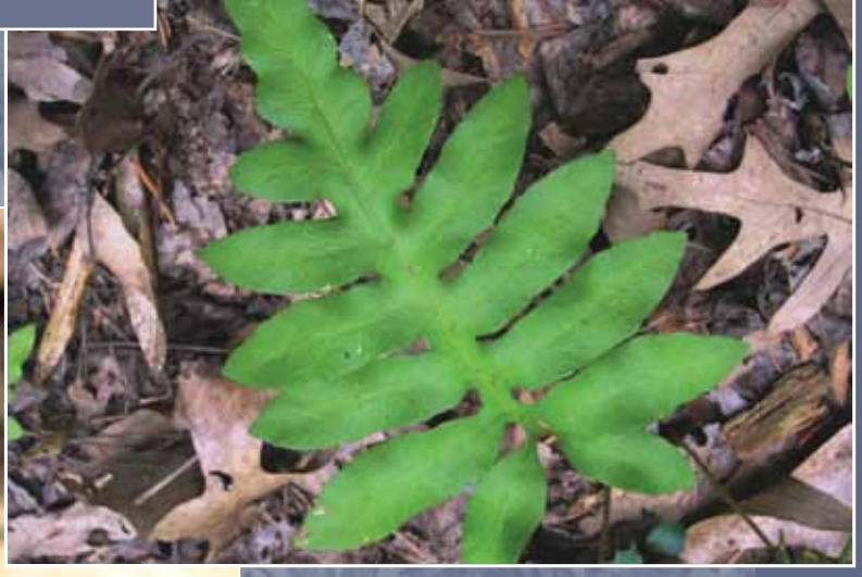
Left: Fertile Frond of Adder's Tongue, Ophioglossum vulgatum. Photo by Ginny Yacovissi

Right: Ragged Fringed Orchid, Platanthera lacera. Photo by Ginny Yacovissi