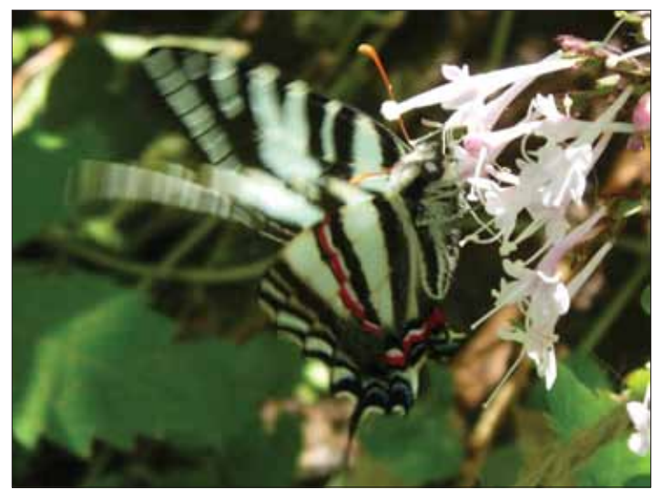
Figure 3. A nectaring Eurytides marcellus (Zebra Swallowtail) on V. pauciflora (Site-2, 25 May 2008). The butterfly's proboscis is extended into a flower, and the butterfly has white pollen on its antenna, body, and legs. It fluttered its wings quickly as it imbibed nectar.