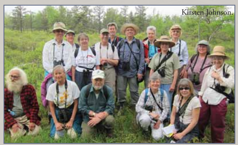
At Long Pond Preserve.