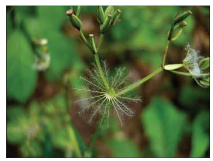
Figure 2. A mature fruit of V. pauciflora with fully expanded plumose calyx bristles (Site-2, 1 June 2008).