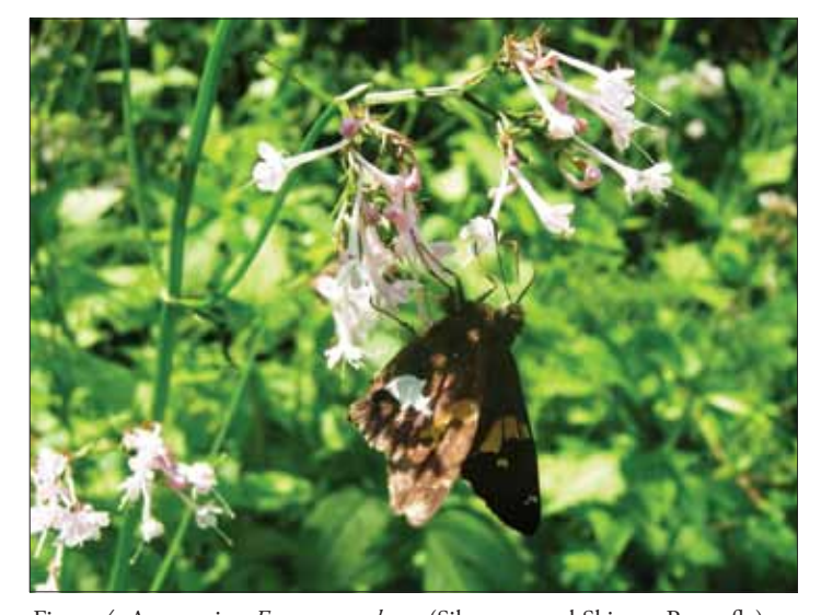
Figure 4. A nectaring Epargyreus clarus (Silver-spotted Skipper Butterfly) on V. pauciflora (Site-2, 22 May 2007). The butterfly's proboscis tip is in a flower, and the inflorescence is in direct sun and partly wilted.