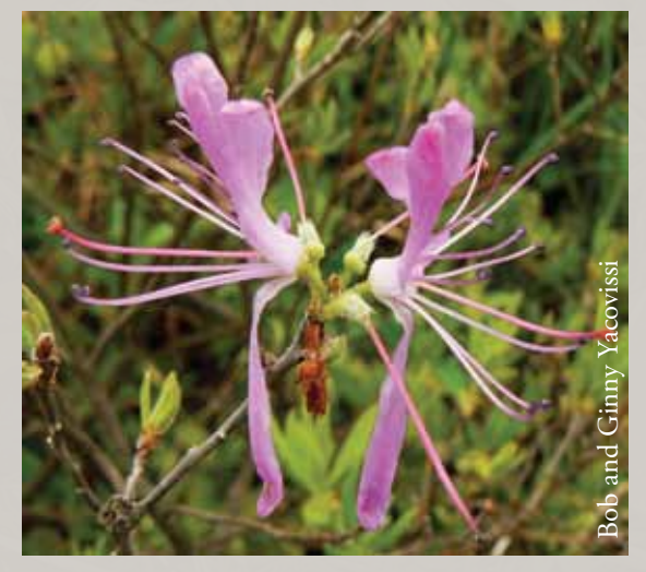
Rhododendron canadense at Long Pond Preserve.