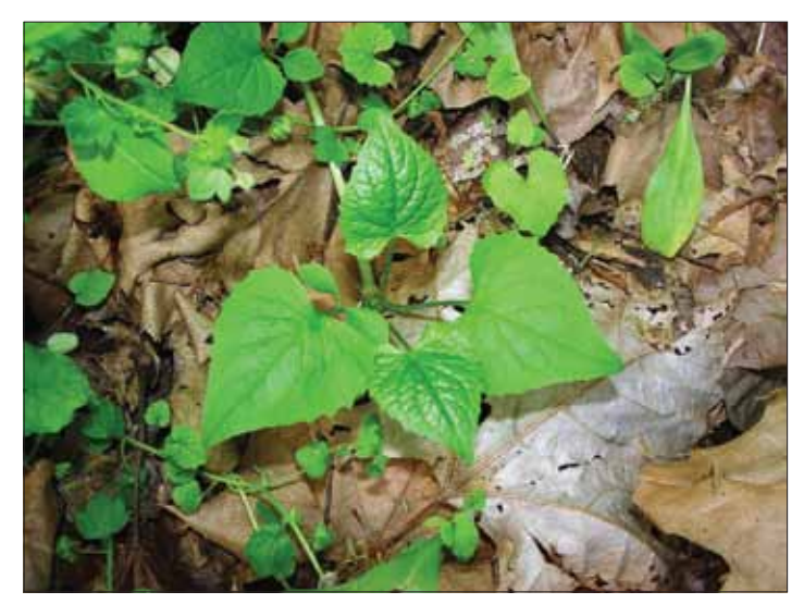
Figure 1. An elongating rosette of Valeriana pauciflora (Site-1, 4 May 2005).

Photo Addendum, Phenology, Insect Associates, and Fruiting of Valeriana pauciflora Michaux (Valerianaceae) in the Potomac River Gorge Area of Maryland and Virginia, United States