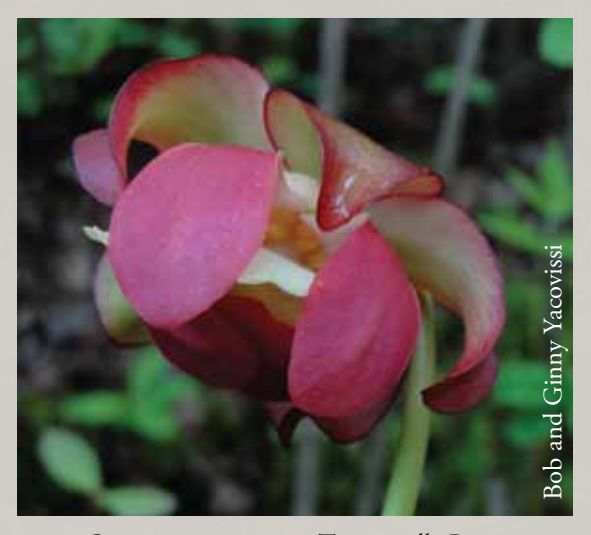
Sarracenia purpurea at Tannersville Bog.