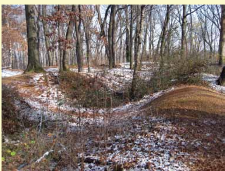
Fort Totten Park, showing remnant of Civil War earthen fortification.