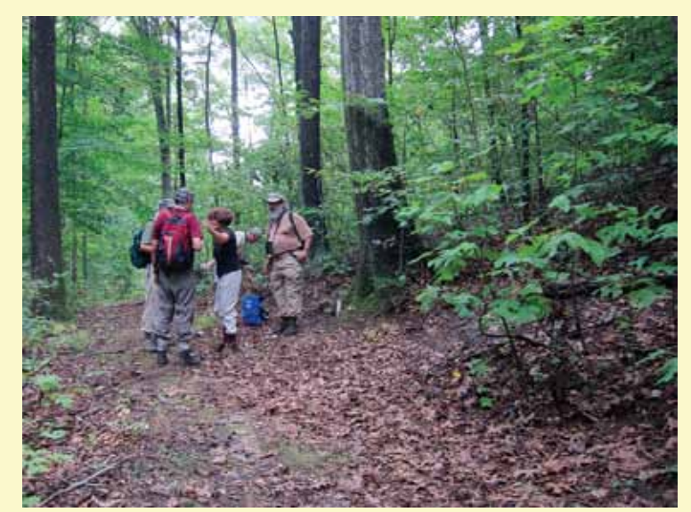
Field trip at Fort Stanton Park, September 2012.