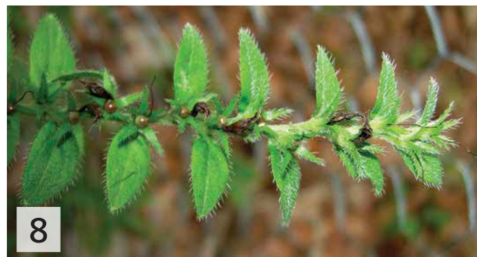
Figure 8. A L. virginianum branch that is in a control cage (one that did not exclude insect pollinators) in GFP on 15 July 2007. Nine nutlets are visible in this photograph.