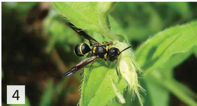
Figure 4. A nectar-robbing Ancistrocerus wasp chewing a hole in the base of a L. virginianum corolla in shoot group-2 in CSNAP on 28 May 2012.