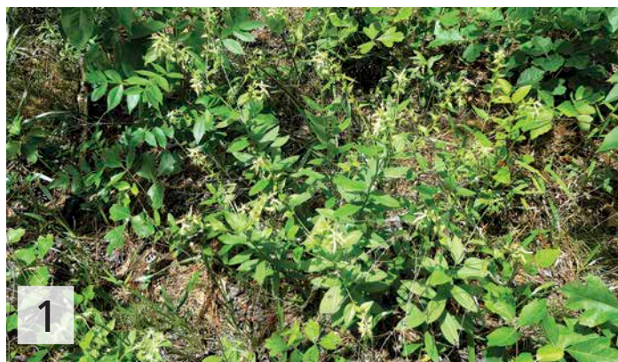
Figure 1. Lithospermum virginianum shoot group-2 in full bloom in Chub Sandhill Natural Area Preserve (CSNAP), Virginia on 27 May 2012. Other plants in this photograph include Diospyros virginiana , Rhus copallina , and Toxicodendron pubescens .