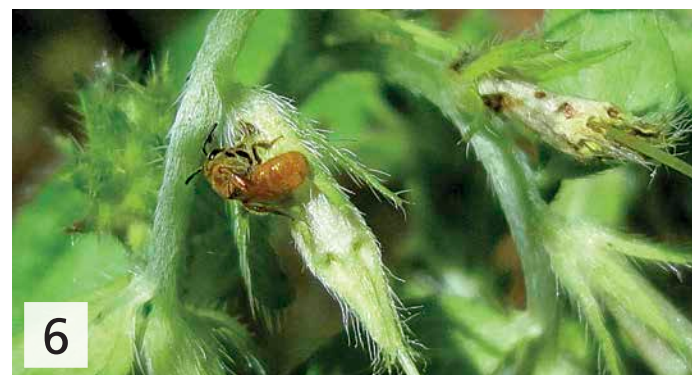
Figure 6. A female Lasioglossum vierecki (sweat bee) secondarily robbing a L. virginianum flower in shoot group-2 in CSNAP on 29 May 2012.