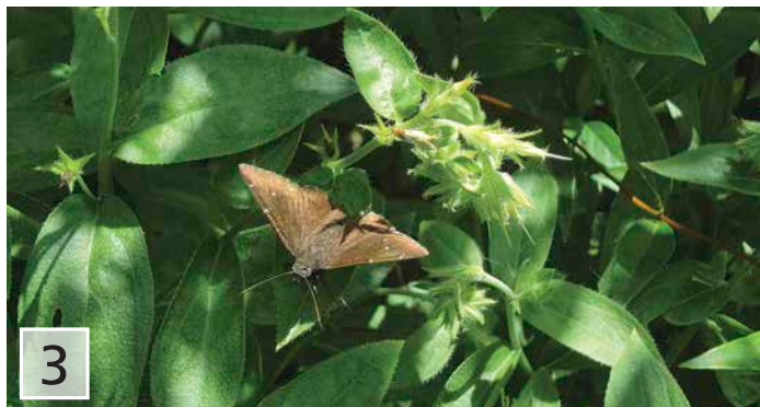
Figure 3. A Thorybes pylades sunning on a leaf of L. virginianum after foraging for nectar in shoot group-1 in CSNAP 28 May 2012.