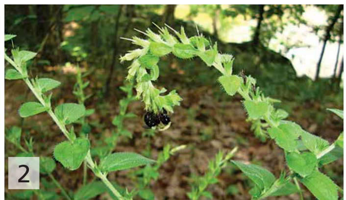
Figure 2. A Bombus bimaculatus worker foraging for L. virginianum nectar from shoot group-4 in Great Falls Park (GFP), Virginia on 15 June 2009. The Potomac River is in the background.