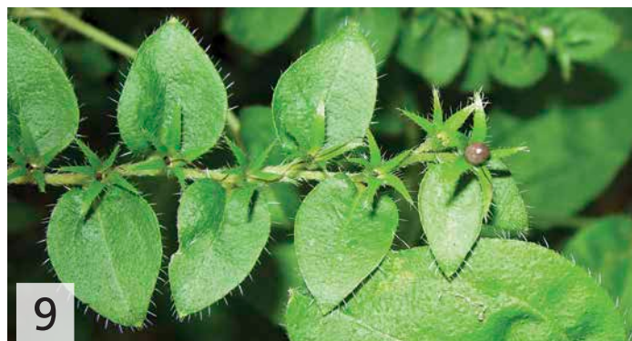
Figure 9. A L. virginianum branch of that is in a pollinator-exclusion cage in Great Falls Park on 15 August 2008. One unripe nutlet and 21 calyxes which did not bear nutlets are in this photograph. Such calyxes often bore only brown, dried, threadlike styles with stigmas.