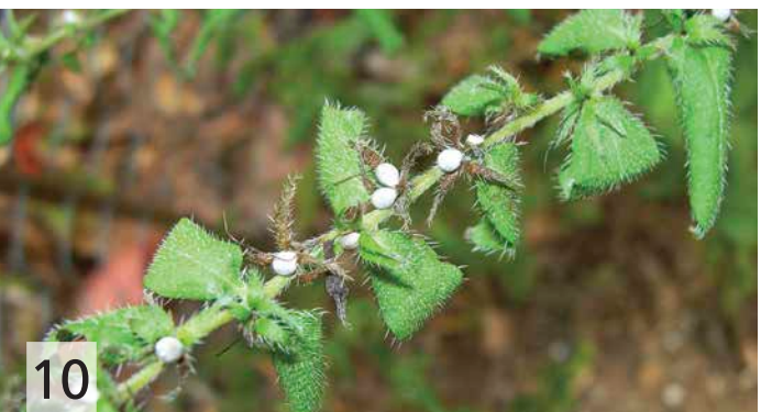
Figure 10. Bony, whitish, ripe L. virginianum nutlets in a control cage in Great Falls Park on 27 August 2008. The leaves were wilted during the summer dry spell.