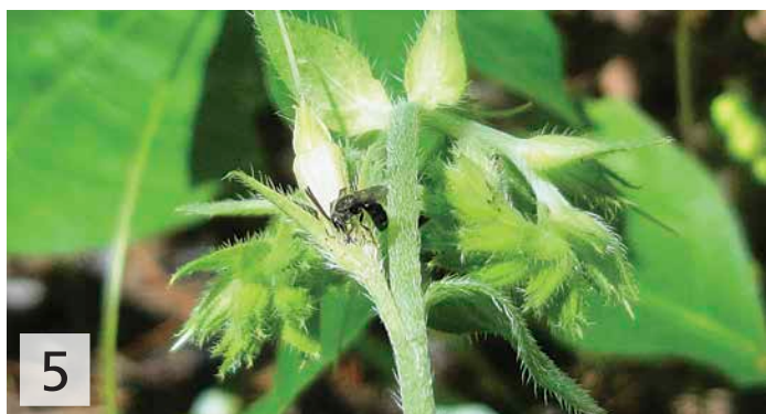
Figure 5. A male Lasioglossum sweat bee secondarily robbing nectar through a hole in the base of a L. virginianum corolla in shoot group-2 in CSNAP on 29 May 2012. Toxicodendron pubescens leaves are in the background.