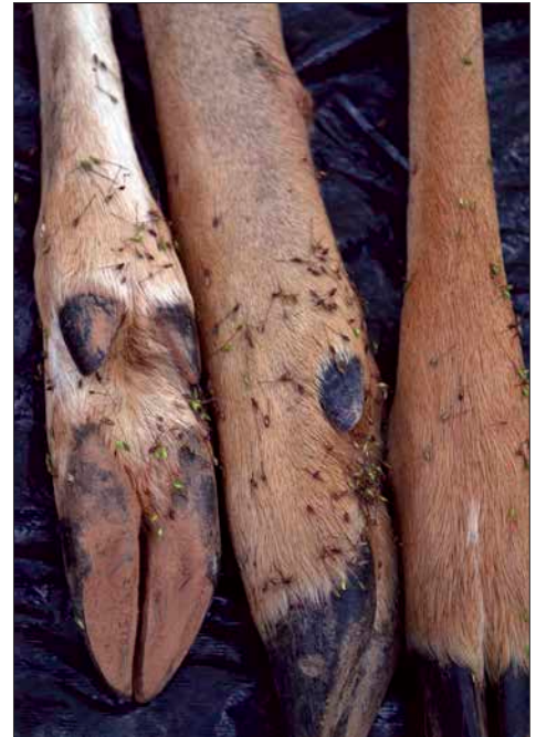
Seeds of WLBG will stick to almost anything.

VB: Another subspecies, Oplismenus hirtellus , ssp. variegatus , is commonly available in the trade. So there's been an idea floating around that WLBG is a reverted form that escaped into Patapsco from the Hernwood landfill. But genetic comparisons do not confirm this. The invasive WLBG is genetically different from the variegated form sold in the trade. Strangely, it seems to bear the closest resemblance to plants native to the Krasnodarskiy region of western Russia. We'll probably never know how it got here.