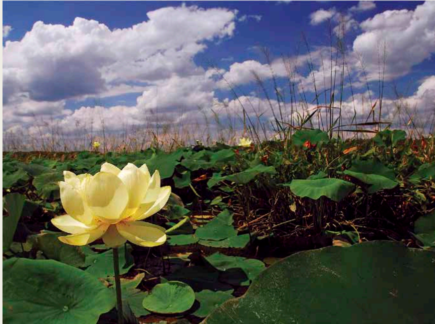
Watched over by Wild Rice (Zizania aquatica), the emergent American Lotus (Nelumbo lutea) blooms in July and August in the freshwater-tidal Mattawoman estuary, the only western-shore site to host a natural population.

of the county can note that their presence is evidence of the potential for heritage tourism to contribute to the local economy. ( cont. page 5 )