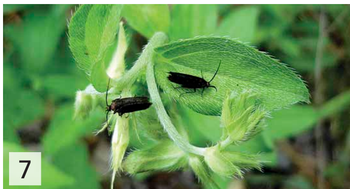
Figure 7. Moths of a species that is a secondary robber of L. virginianum nectar in shoot group-2 in CSNAP on 28 May 2012. The left moth is imbibing nectar through a hole in the basal part of a flower's corolla. The right moth is resting.