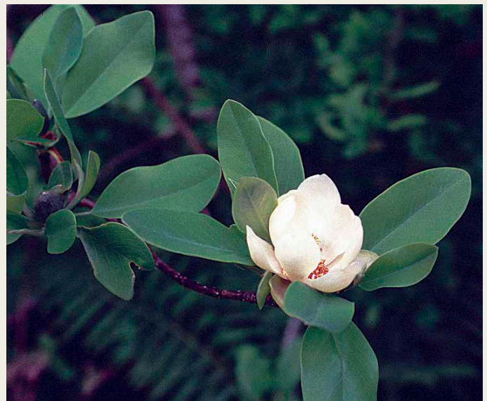
Sweetbay Magnolia (Magnolia virginiana). Globally rare (G1) Magnolia Bogs serve as the sources for two Mattawoman Creek tributaries, but are threatened by new and planned subdivisions.