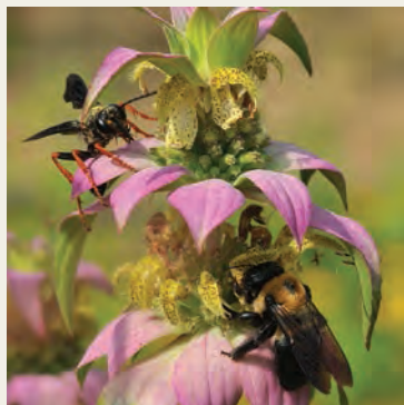
Spotted mint, Monarda punctata