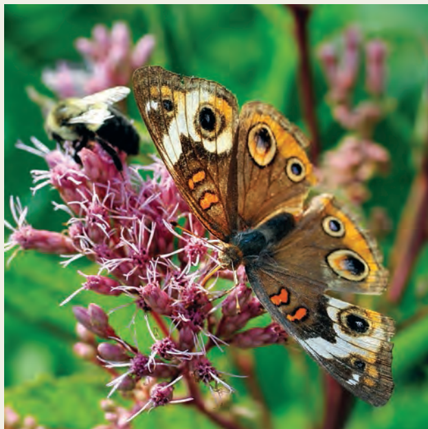
Hollowstem Joe Pye weed, Eutrochium fistulosum, visited by a buckeye butterfly and a bumblebee.

If a plant isn’t a hybrid or a cultivar, it is open-pollinated. Some trees and most grasses and ferns are wind pollinated and windborne seeds have an