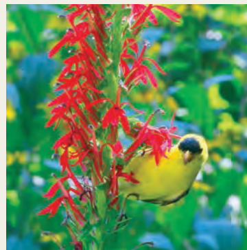
Cardinal flower, Lobelia cardinalis, and an American goldfinch.