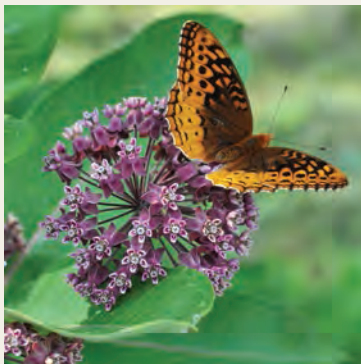
Common milkweed, Asclepias syriaca, visited by a great spangled fritillary