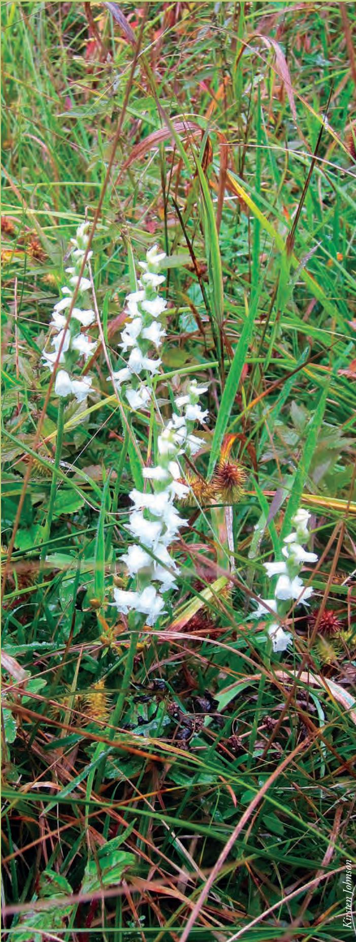
Nodding Ladies Tresses ( Spiranthes cernua ) along the lake at New Germany St Park

3. Acer pensylvanicum L; Striped Maple; Sapindaceae (Soapberry Family). Note that Flora of Virginia includes Aceraceae (Maple Family) within Sapindaceae.