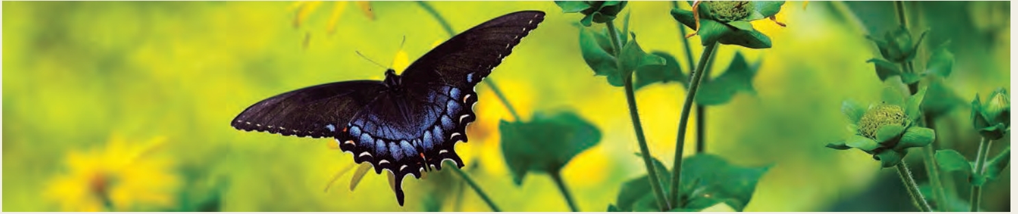
Cupflower, Silphium perfoliatum , with a Spicebush swallowtail.