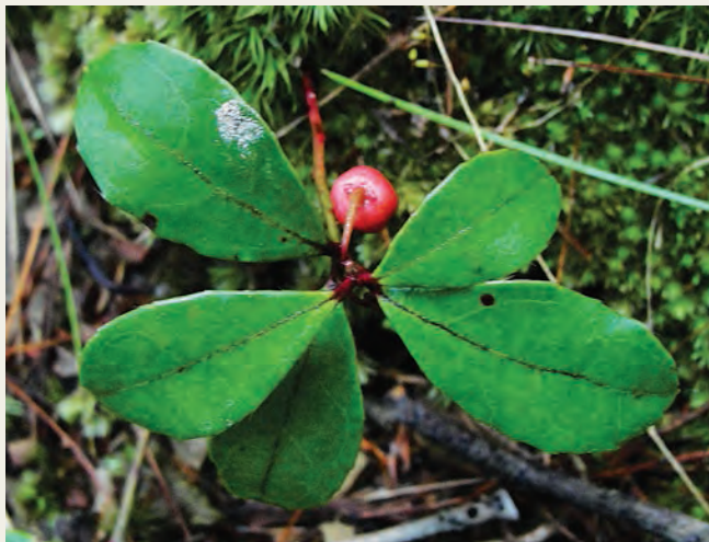
Wintergreen, Gaultheria procumbens, fall conference field trip to Fifteen Mile Creek.

Leaves: Alternate, simple, shiny evergreen, leathery and glabrous, with a strong wintergreen flavor. Elliptic or obovate, shallowly toothed or entire, ¾–2" long.