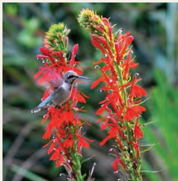
Cardinal flower, Lobelia cardinalis, visited by a ruby-throated hummingbird