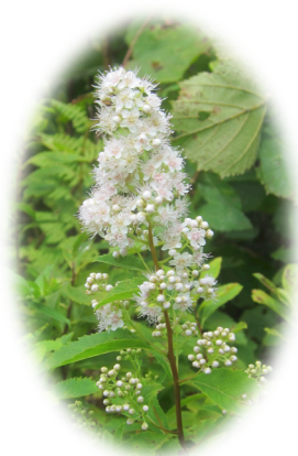
Spiraea alba , white spiraea