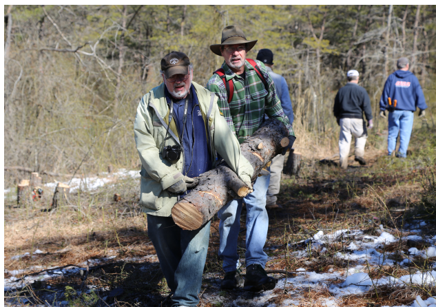
Volunteers clear Virginia pines from the serpentine area of Robert E Lee Park, Baltimore Co.