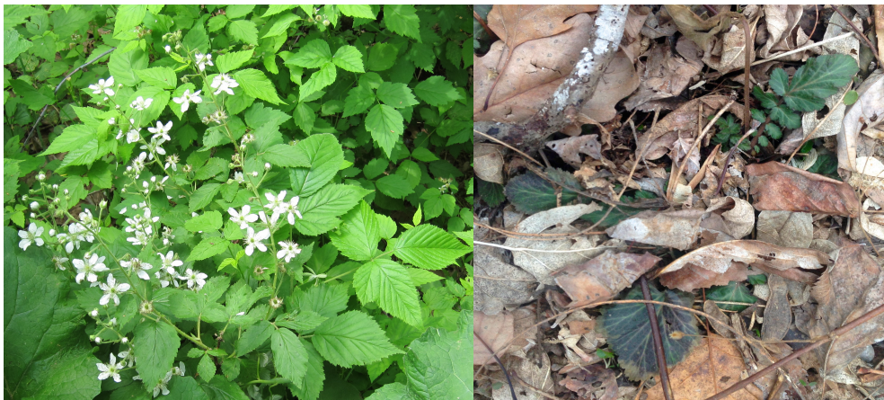
Rose family member, Geum canadense , white avens, in flower (L) and winter rosette (R)