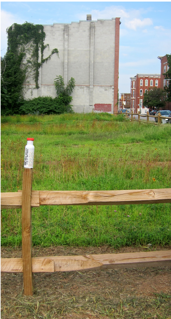
West Baltimore is an area with many vacant buildings and lots.

The photos below were taken during a July visit to the experimental sites.