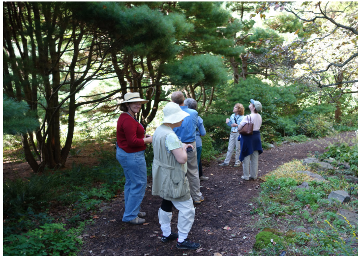
Conference Field Trip to Mt Cuba Center.