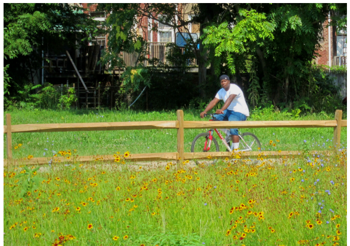
Fences demarcate the experimental lots but do not prevent entry.